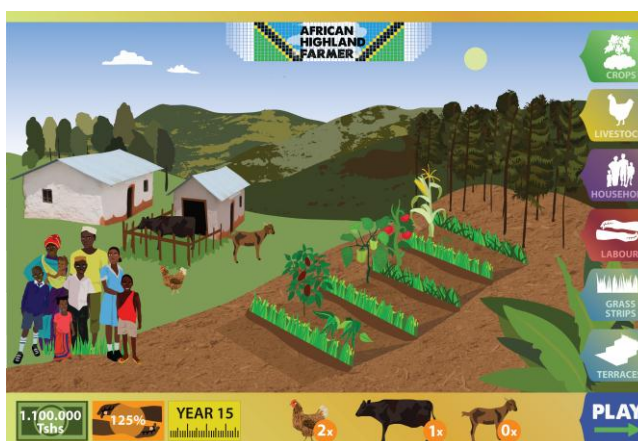
Figure 1 – The main playing field, 'African Highland Farmer'